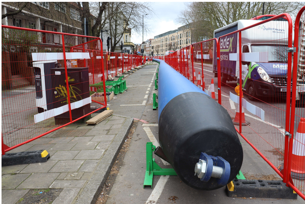
Image 2: Looking from launch pit with the tow head and pipe string along Seven Sisters Rd