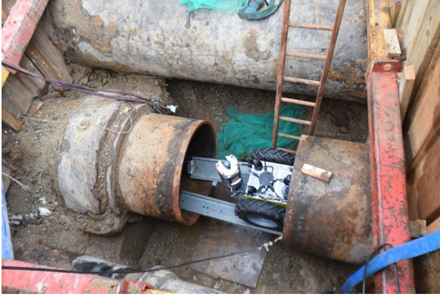
Image 5: Host pipe at reception pit showing proximity of adjacent pipelines