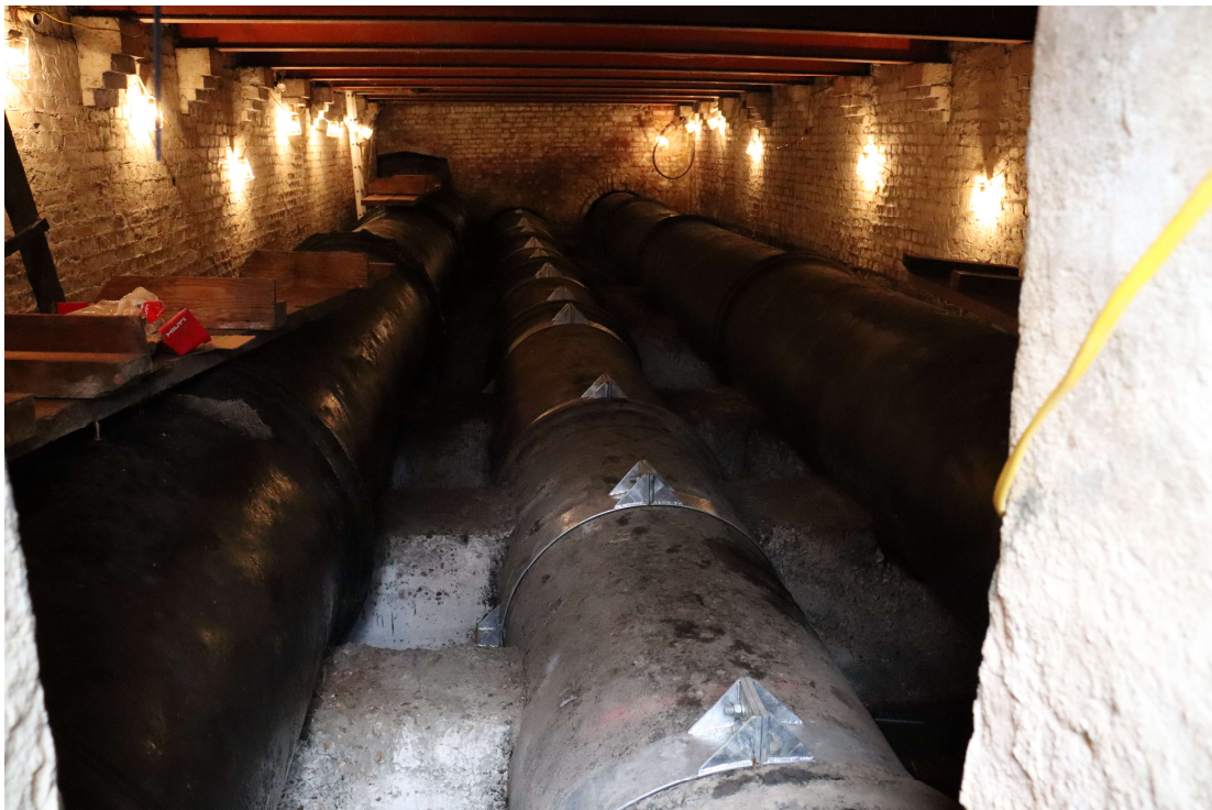
Image 4: Host pipe in culvert with straps showing proximity of adjacent pipelines