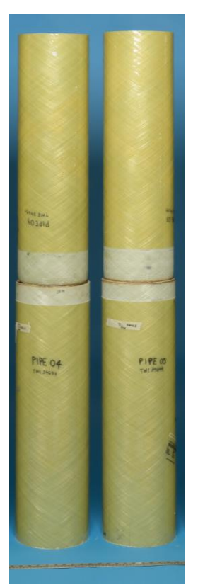
Figure 4 Two Fully Thermoplastic Welded/Assembled Glass Reinforced Thermoset Pipes (8" Pipe, 2m Demonstrator)