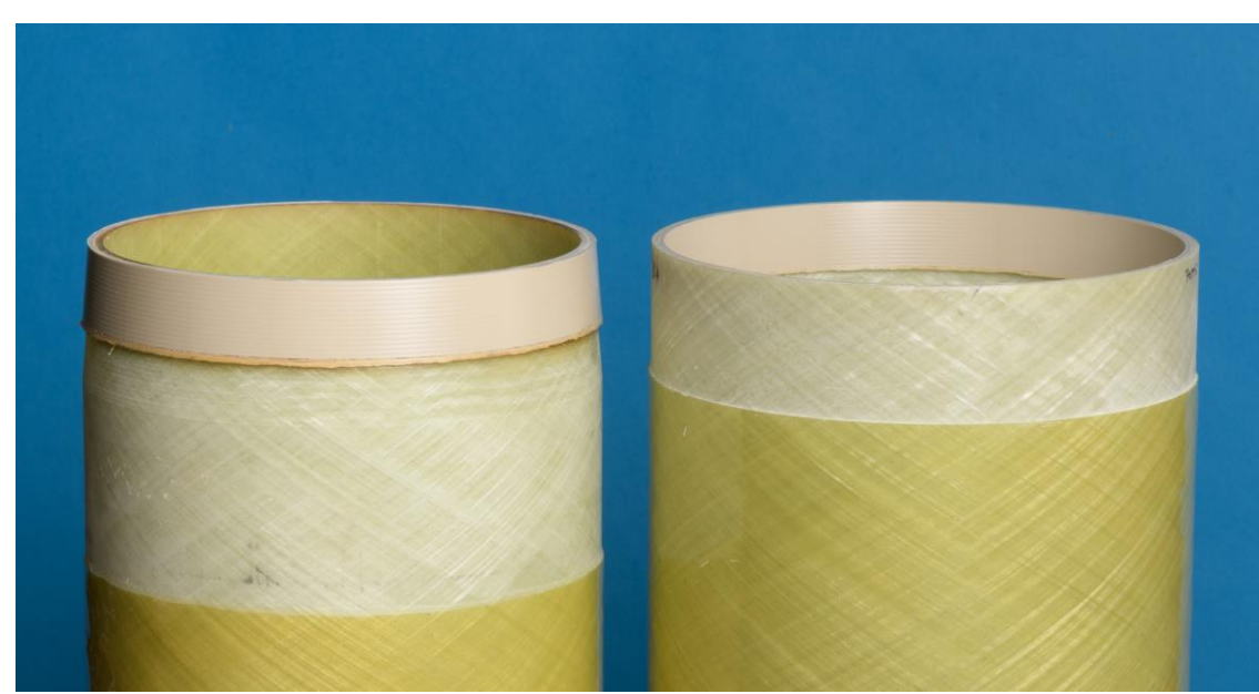
Figure 2 Pipes Post Friction Welding - Prior to Final Pipe to Pipe Joint Assembly (8" Pipe)