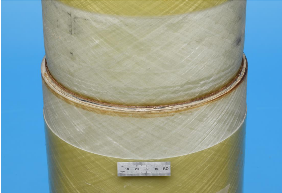
Figure 3 Fully Thermoplastic Welded/Assembled Glass Reinforced Thermoset Pipe (8" Pipe)

F150 First Floor, Cherwell Business Village, Southam Road, Banbury 0X16 2SP t +44(0)20 7235 7938 f +44(0)20 7235 0074 e hqsec@pipeguild.com www.pipeguild.com